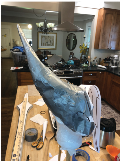
Work in progress: helm

The sword and helmet were made from foam in order to be light. However more rigid materials were used internally to insure adequate structural integrity.